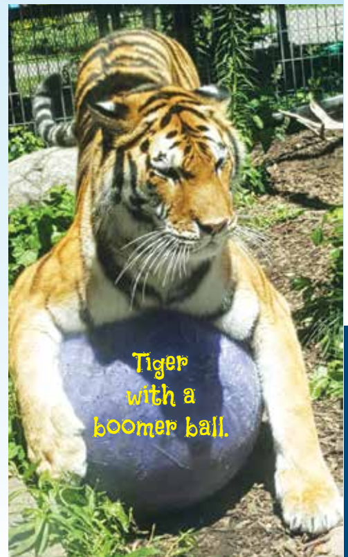
Tiger with a boomer ball.

During one of your visits to the zoo you may encounter a zookeeper training on animals. This is operant conditioning and the animals choose if they want to participate in a session. In this picture zookeeper Bill Gallagher is using a round red ball as a target for Ralph the swift fox. The zookeepers are working on calming these rambunctious canids and they are also building relationships with the animals so if the time comes where examinations or medications are necessary they can be implemented in a less stressful way for the animals.