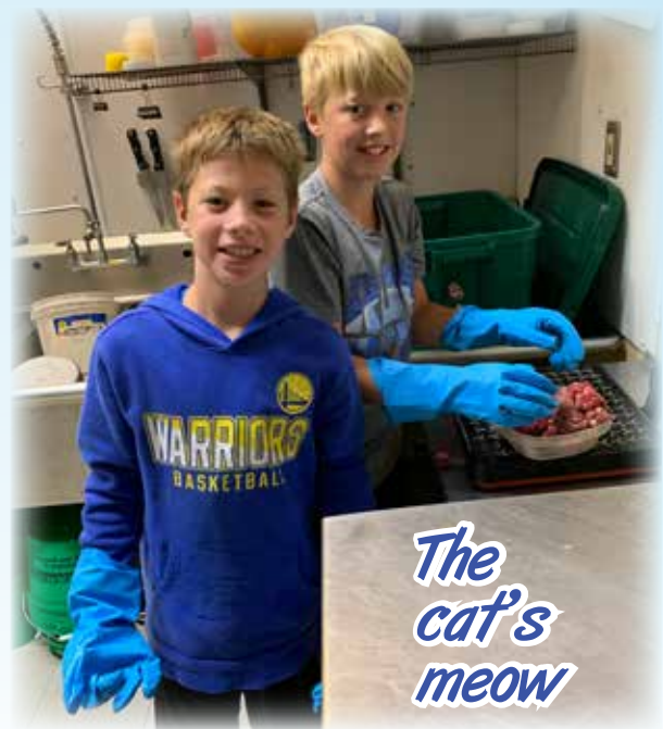
The cat's meow