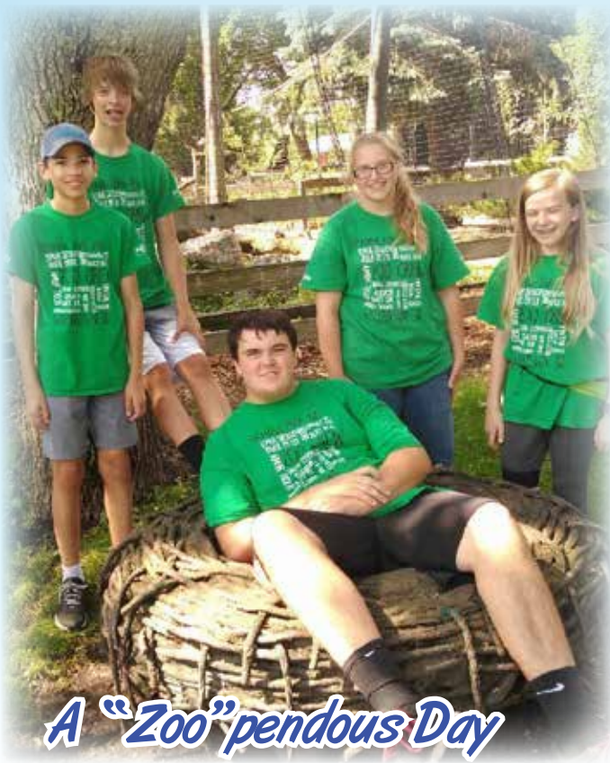
A "Zoo"pendous Day