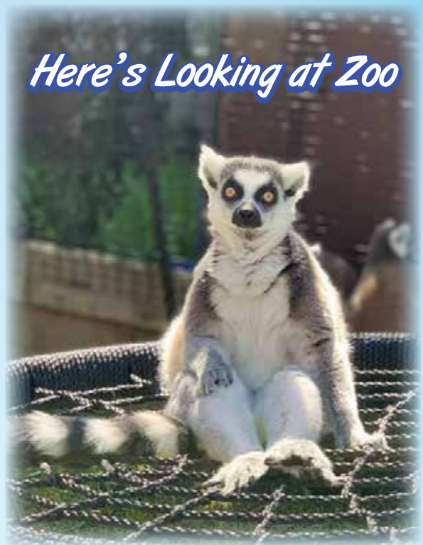
Here's Looking at Zoo