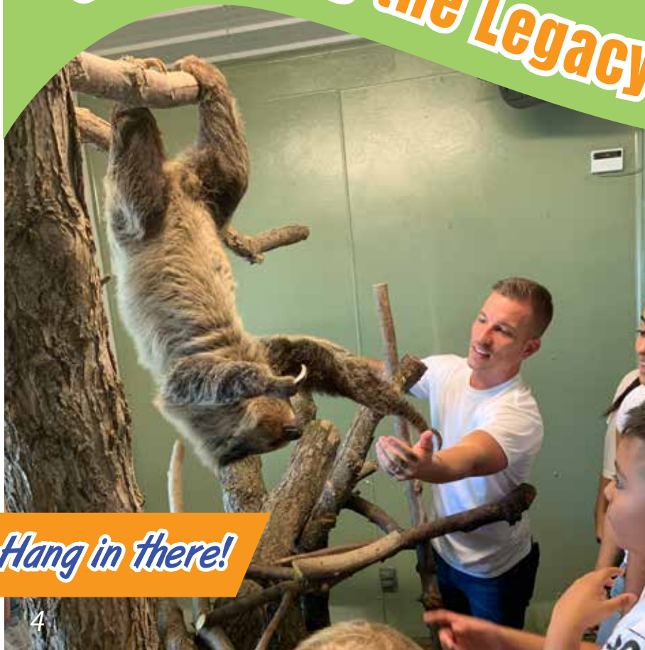
Hang in there!