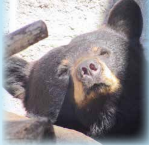
Grin and Bear it