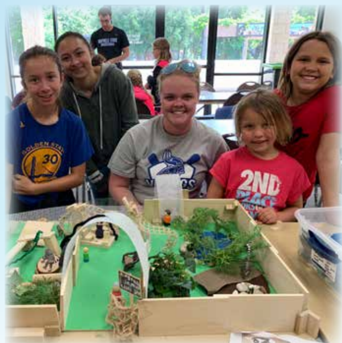
Where the Wild Things Are