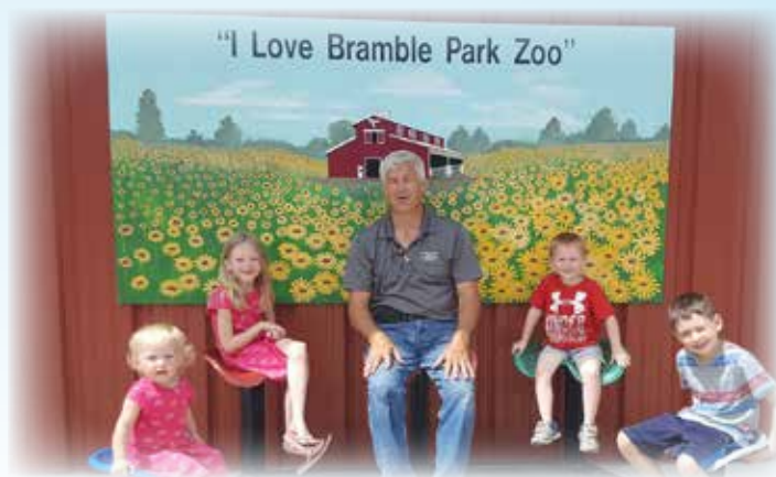
At the Zoo